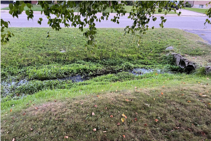
FRONT OF 242 SADDLER ST. E