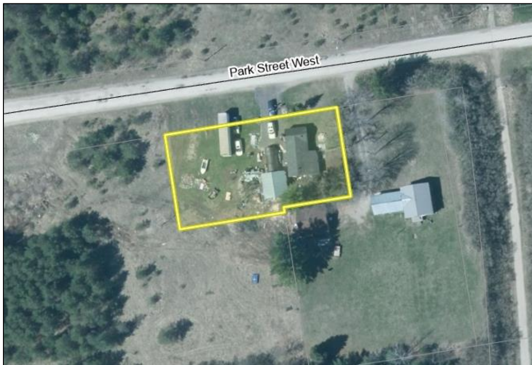
Map 1: Location of the Subject Lands 419 Park Street West