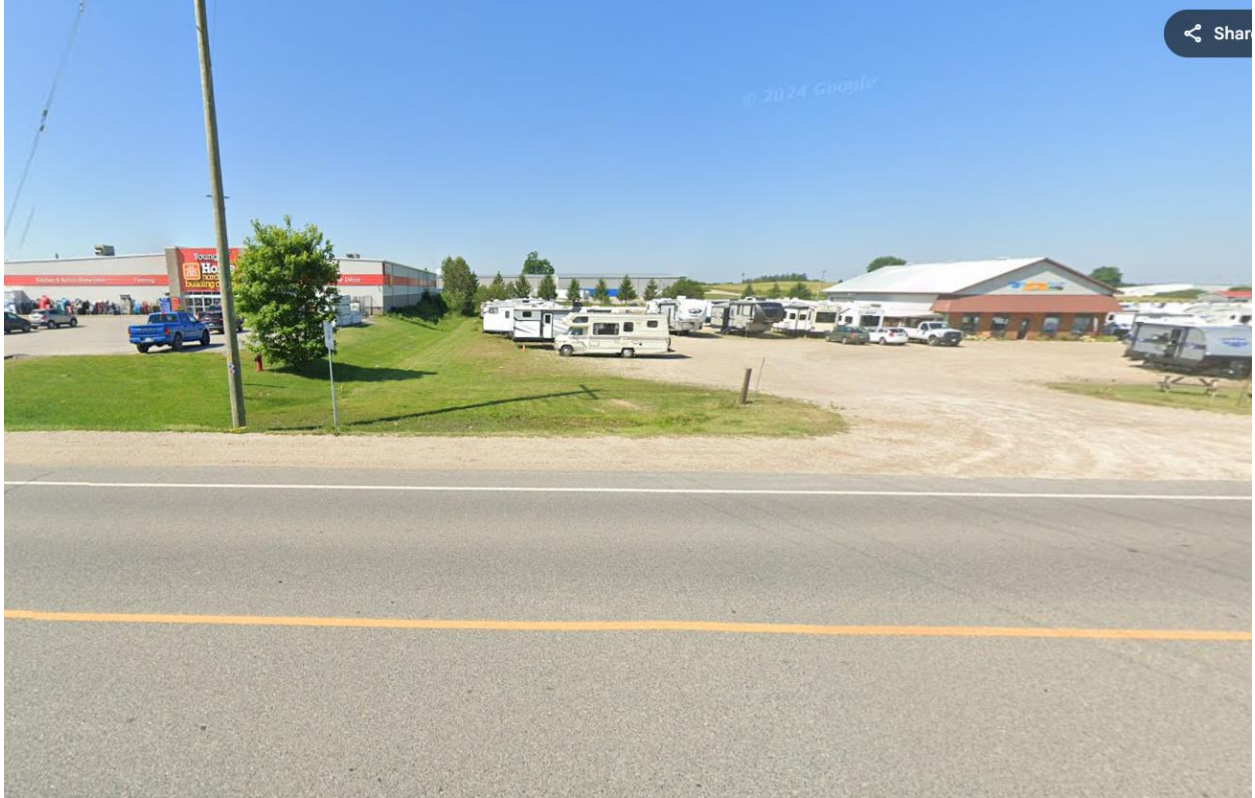
Figure 2: Street View from Highway 6