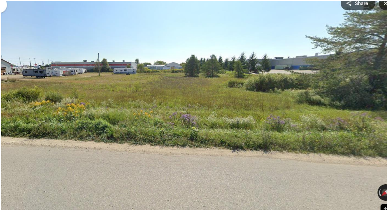
Figure 3: Street View from Watson Drive