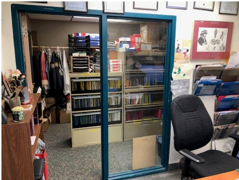
Cramped office space.