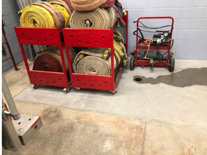
Lower tower area after painting by staff. Notice the filled in drain pit area that eliminated previous trip hazard.