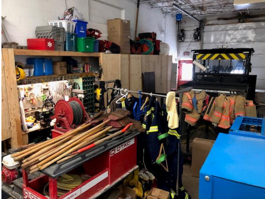
Cramp work area rear bay