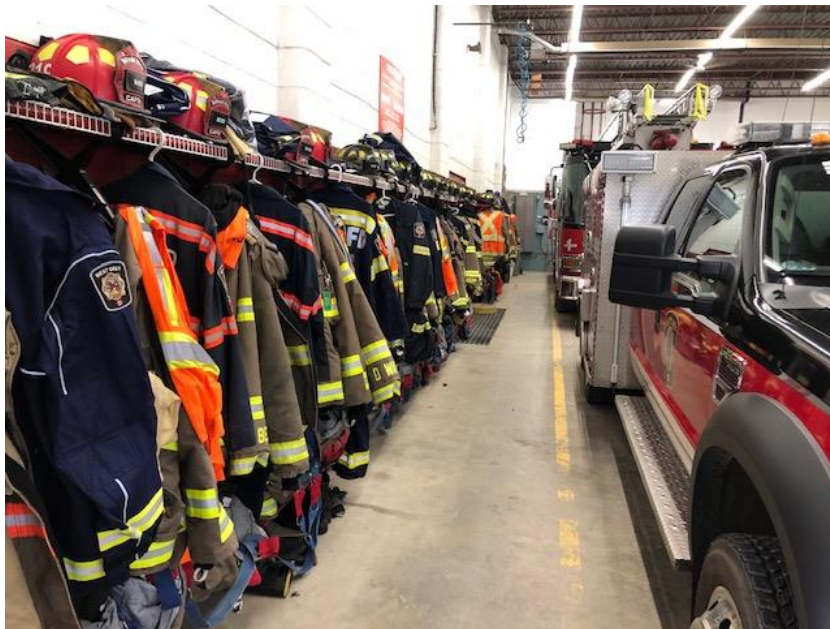
Turnout gear present storage.