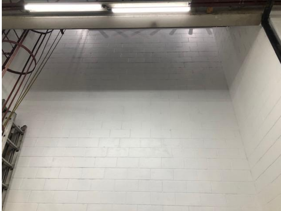
Same area today, after clean-up and painting.