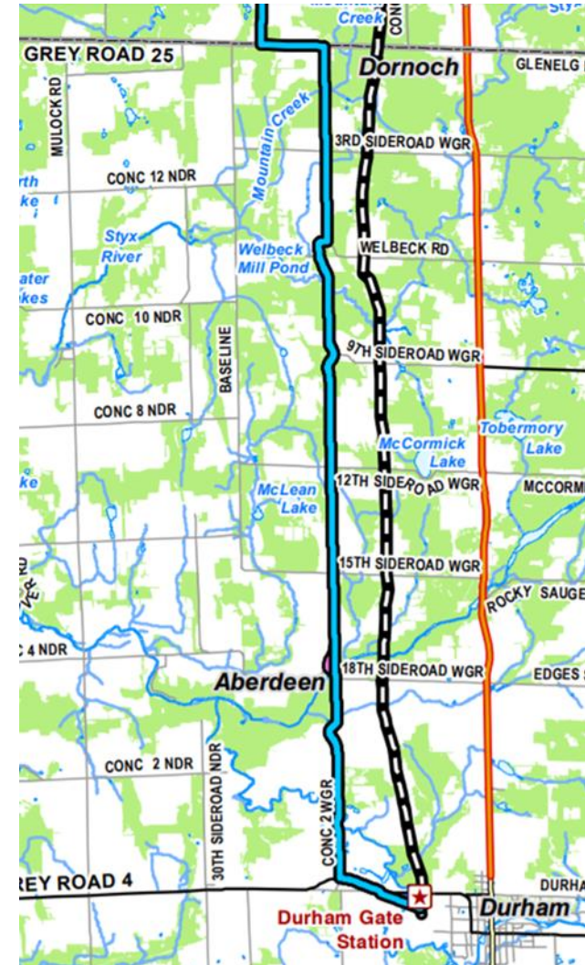
Picture of Project map